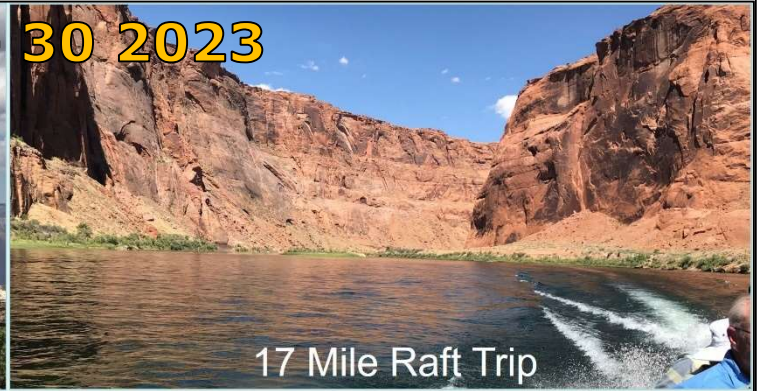
17 Mile Raft Trip